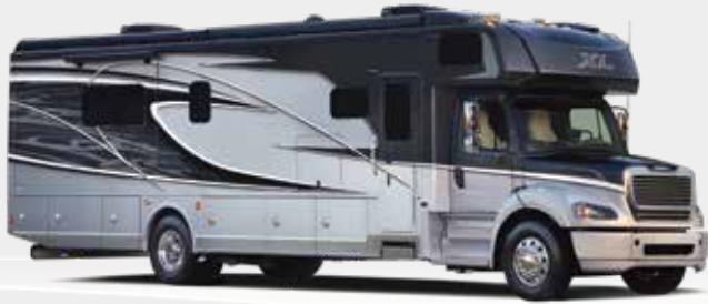
Extended Front Cap with Cab-Over Bunk