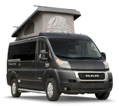
Granite Crystal Metallic