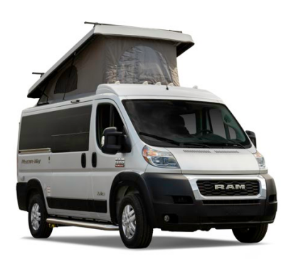
Bright Silver Metallic