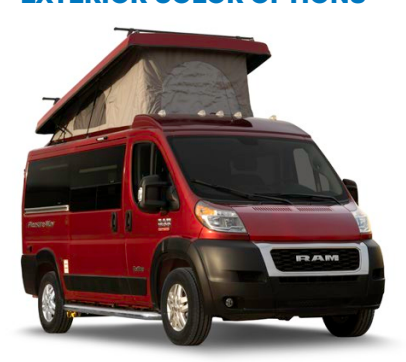
Deep Cherry Red Crystal Pearl