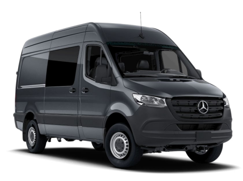
Tenorite Grey Metallic