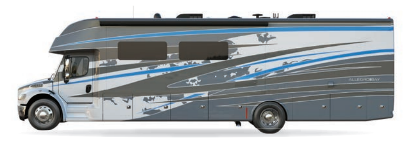
G1 GLACIER BLUE