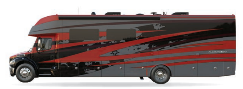
G1 FIRE OPAL