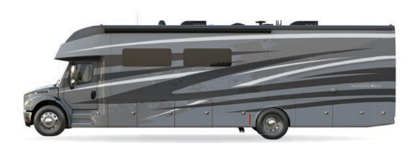
G1 FROSTED GRANITE