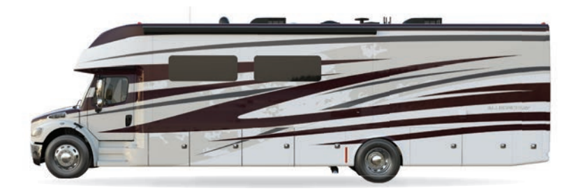
G1 WHITE MAHOGANY