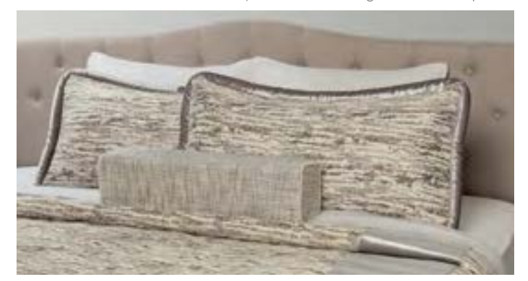
YUKON INTERIOR a. Furniture/Fabric b. Flooring c. Counter Top