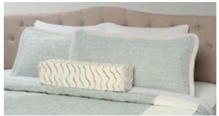
BRUNSWICK INTERIOR a. Furniture/Fabric b. Flooring c. Counter Top