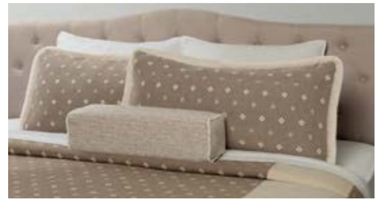
MANITOBA INTERIOR a. Furniture/Fabric b. Flooring c. Counter Top