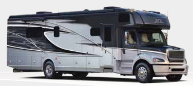
Extended Front Cap with Cab-Over Bunk