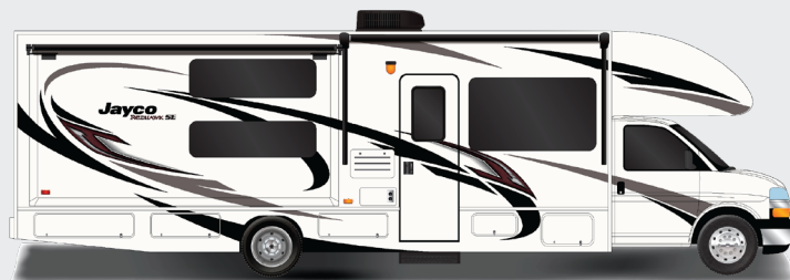
Standard Graphics Package