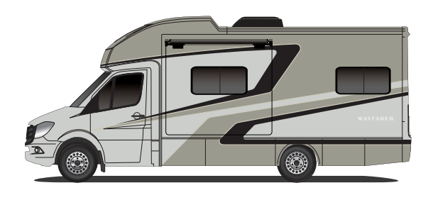
G6 SEA MIST