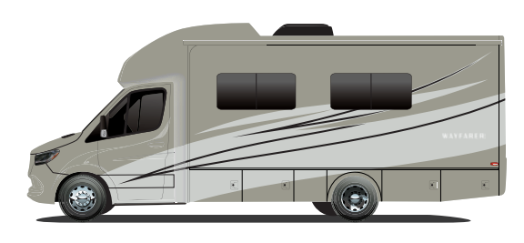
G4 SEA MIST