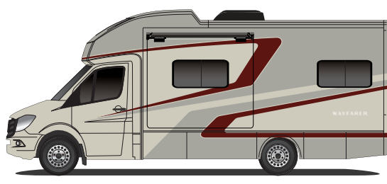
G6 SAND DRIFT