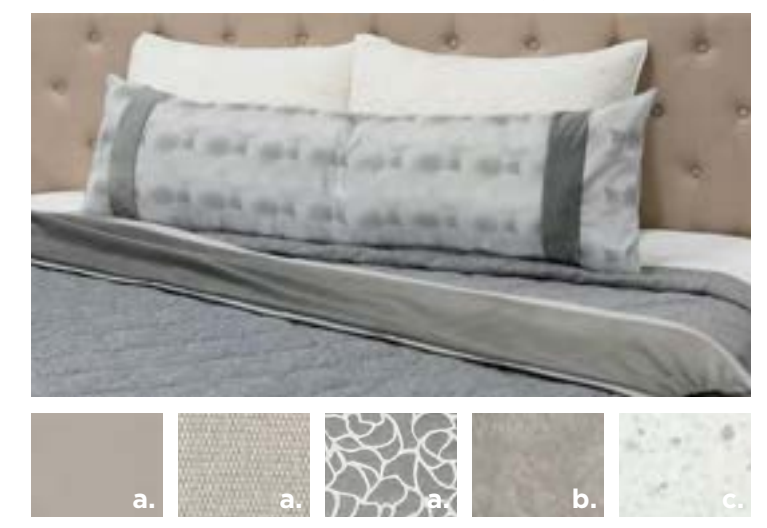
*Exterior colors and interior décor options can be matched to customer preference.