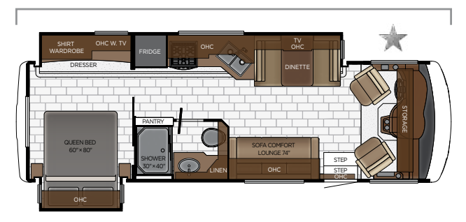
Length: 29' 11"