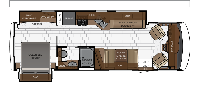
Length: 30′ 11″