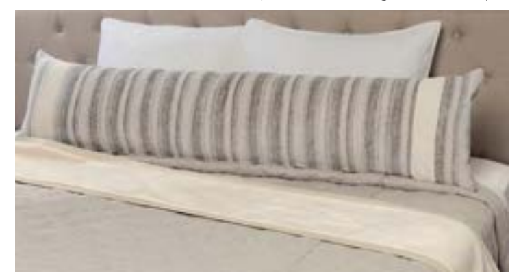
WRIGLEY INTERIOR a. Furniture/Fabric b. Flooring c. Counter Top