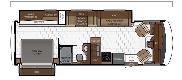
Length: 29' 11"