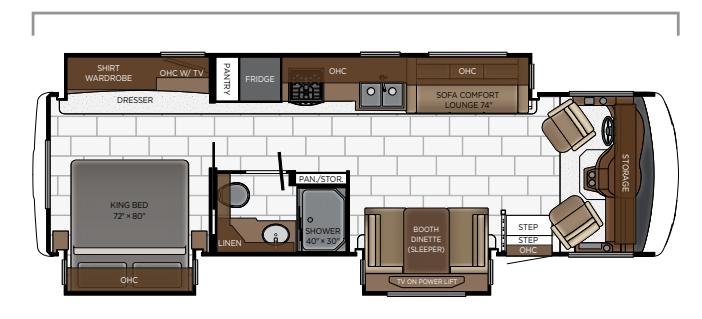
Length: 32′ 11″