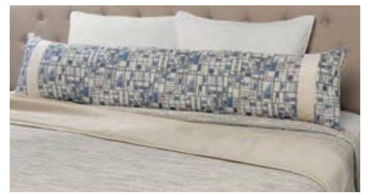
CERVO INTERIOR a. Furniture/Fabric b. Flooring c. Counter Top