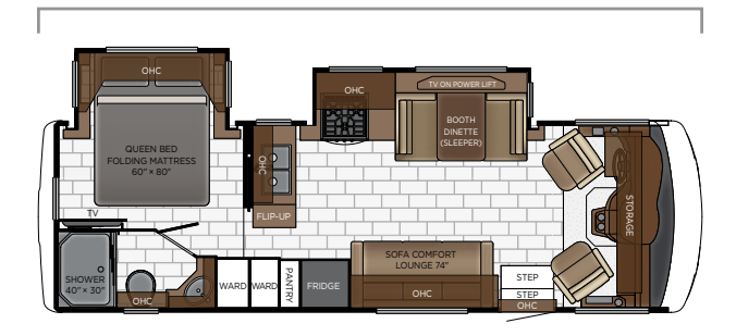
Length: 28′ 11″